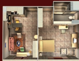
Junior Suite 60 sq.m.