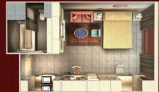
Deluxe Room 36 sq.m.