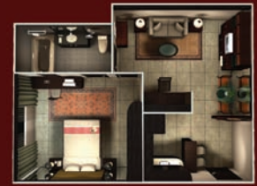
Deluxe Suite 50 sq.m.