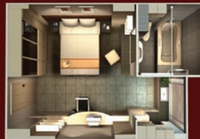
Standard Room 26 sq.m.